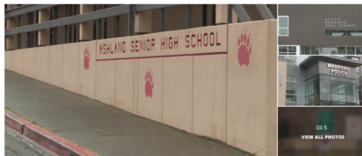
Swatting is when a call comes into dispatch and requires multiple officers to gather together at one generalized location. Luckily the calls today were a hoax. (Malik Patterson/KTVU)

by Malik Patterson | Tue, February 21st 2023, 6:13 PM PST